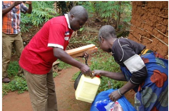
Some of the families provided with essential commodities.