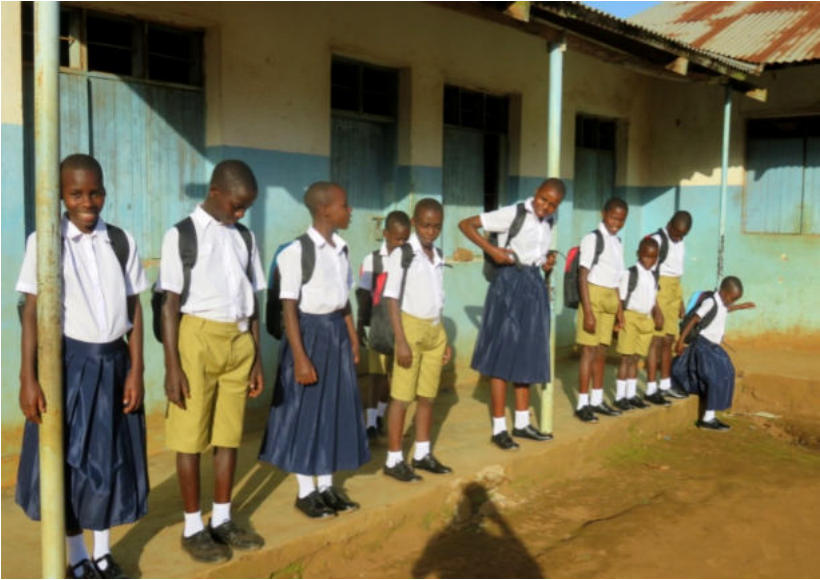
The photos below show the supported pupils pausing after receiving and fitting themselves in the new provided uniforms.