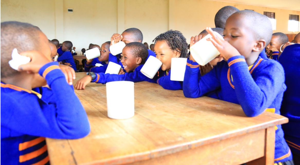
The photo above shows some of the Primary School children taking break tea and the photos below (left) show children playing football with Volunteers and (Right) participating in their Class rooms.